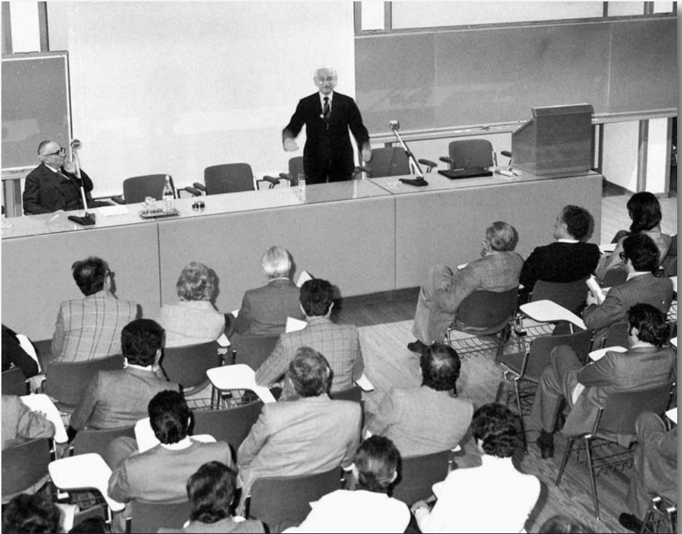
Sabin lecturing on polio vaccines at Sclavo Institute of Siena, Italy, 1970.

After the first visit by Sabin, the Sclavo Institute started growing into a solid manufacturer and eventually also became one of the foremost centers of excellence in research and development for vaccines. Today the Sclavo Institute has developed into Novartis Vaccines and Diagnostics , a global leader in the field of vaccines against infectious diseases both in industrialized and, more importantly, in developing countries.