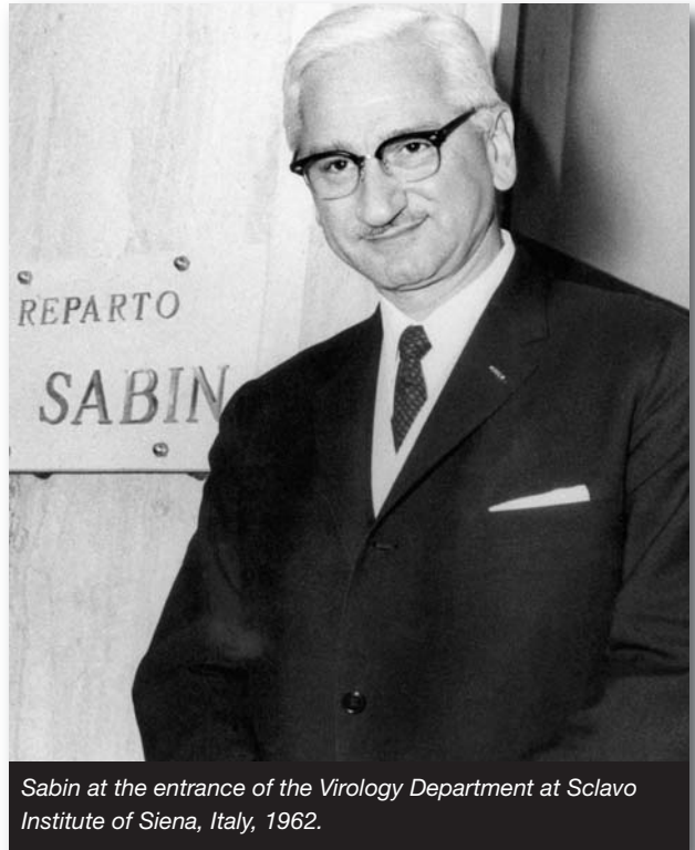
Sabin at the entrance of the Virology Department at Sclavo Institute of Siena, Italy, 1962.

In 1959 Albert Sabin , inventor of the polio vaccine, decided that the Sclavo Institute in Siena was the most suitable place to produce his vaccine, both for the advanced technology of the company, as well as for the stimulating environment that the Tuscan city offered. So the Sclavo Institute became a major producer of the vaccine and the new Virology Department was named after Sabin.