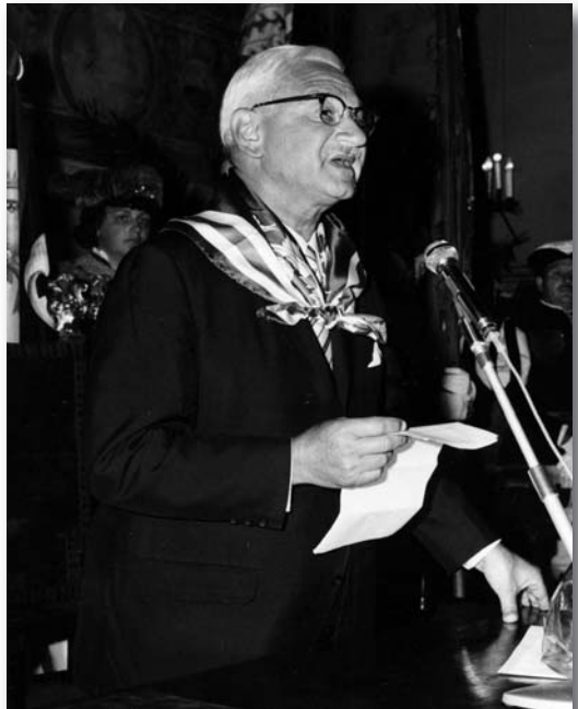
In 1970 Sabin became honorary citizen of Siena. At the ceremony in the town hall, Sabin wore the scarf of the Contrada dell'Oca of which he had become protector.

In 1968, Sabin was awarded the Mangia d'Oro , the highest recognition of the city of Siena. It was the first time a foreigner had been awarded the prize.