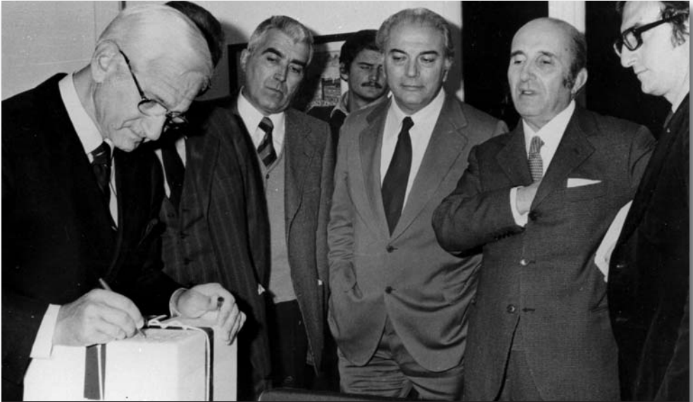
Sabin approving the first batch of polio vaccines manufactured at the Sclavo Institute of Siena, Italy, 1964

During those years Sabin visited Siena several times to transfer all the necessary technology and to follow the production of the vaccine. These frequent visits also helped Sabin to appreciate the people and culture of Siena and very soon the city started to consider him a real Senese . Sabin's admiration for Siena became so strong that he became protector of the Contrada dell'Oca .